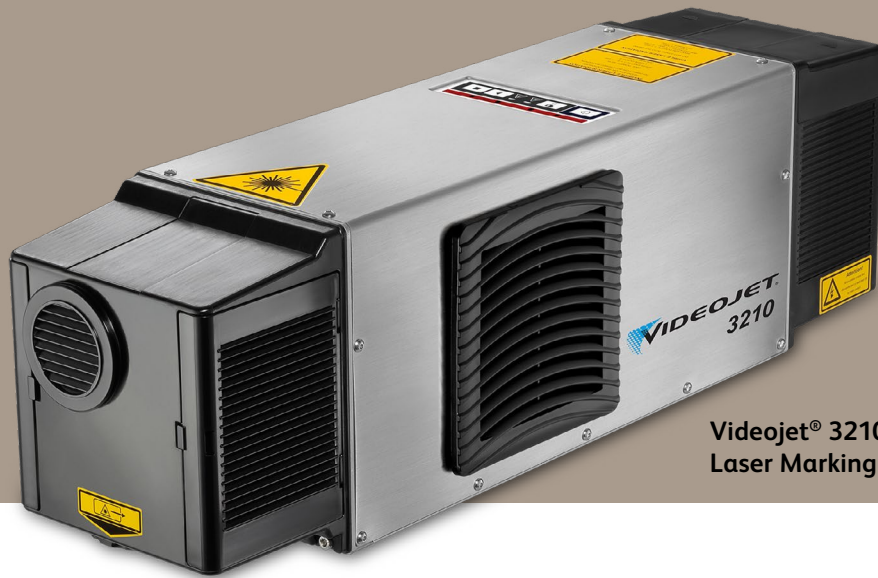
Videojet® 3210 Laser Marking System